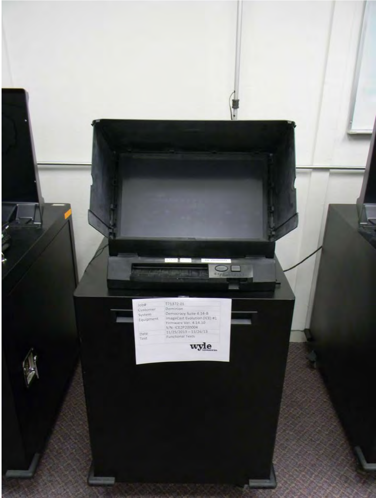
Photograph 1 Functional Tests: ImageCast Evolution #1 S/N ICE2P200004