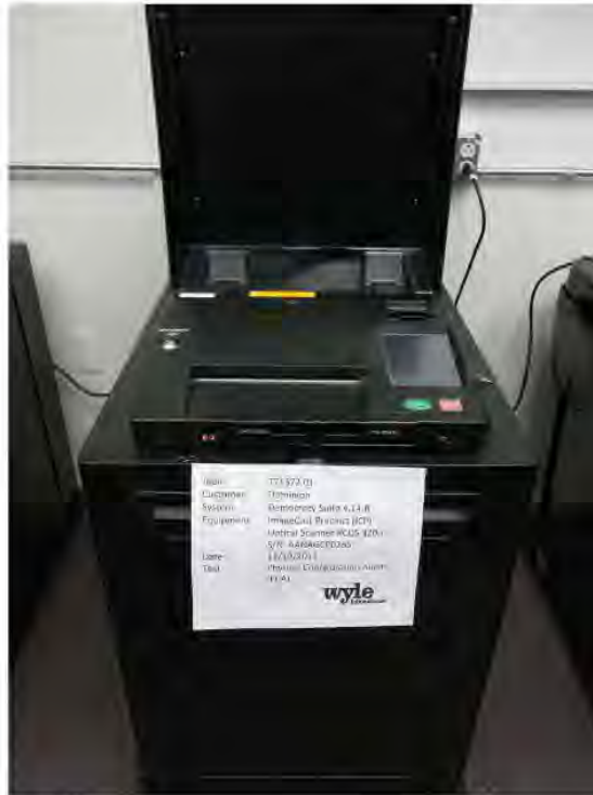
Photograph 2: ImageCast Precinct (ICP) on Metal Ballot Box

In addition, enhanced accessibility voting may be accomplished via optional accessories connected to the ImageCast unit. The ICP utilizes an ATI device to allow voters with disabilities to navigate and submit a voted ballot. This is accomplished by presenting the ballot to the voter in an audio format. The ATI is connected to the tabulator, and allows the voter to listen to an audio voting session consisting of contest and candidate names. The ATI also allows a voter to adjust the volume and speed of audio playback. The cast vote record is recorded electronically when the ATI is used to cast a ballot. There is no contemporaneous paper ballot or paper record produced when the ATI is utilized for voting. A ballot arising from the voter's choices may be printed from EMS at a later time.