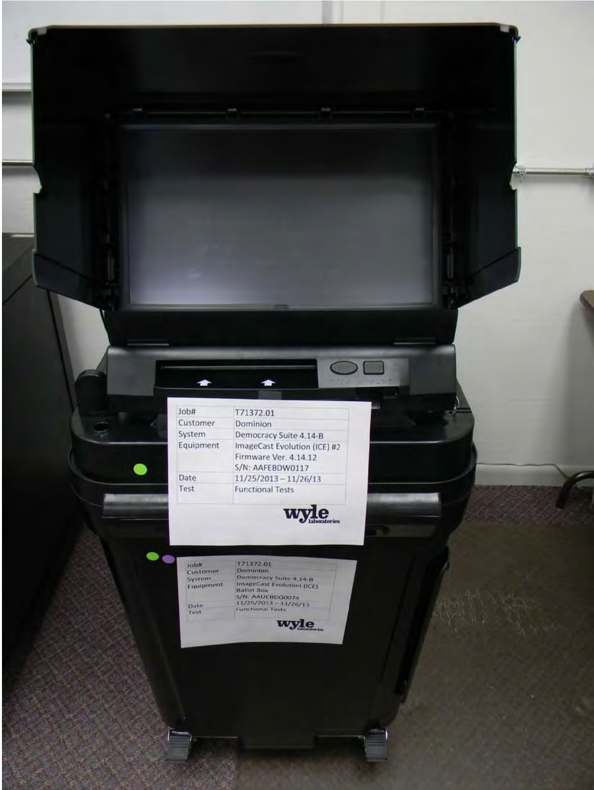
Photograph 2 Functional Tests: ImageCast Evolution #2 S/N AAFEBDW0117 mounted on ICE Plastic Ballot Box S/N AAUCBDQ0074