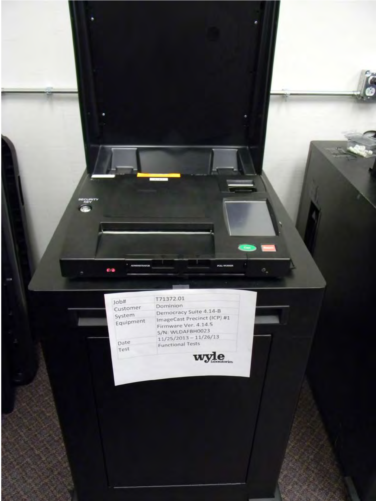
Photograph 3 Functional Tests: ImageCast Precinct #1 S/N WLDAFBH0023