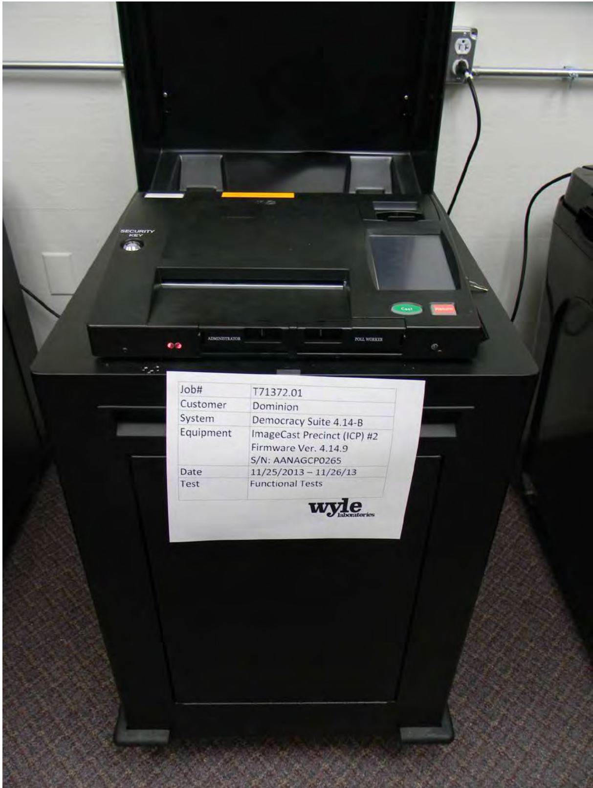
Photograph 4 Functional Tests: ImageCast Precinct #2 S/N AANAGCP0265