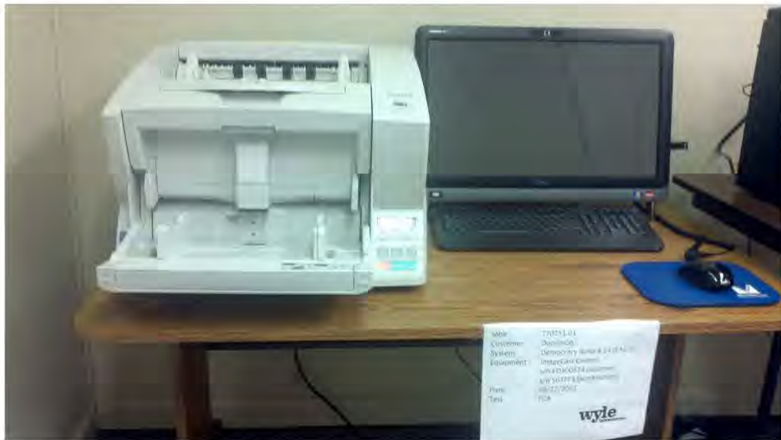
Photograph 3: Canon DR-X10C Scanner and ImageCast Central Workstation

(The remainder of this page intentionally left blank)