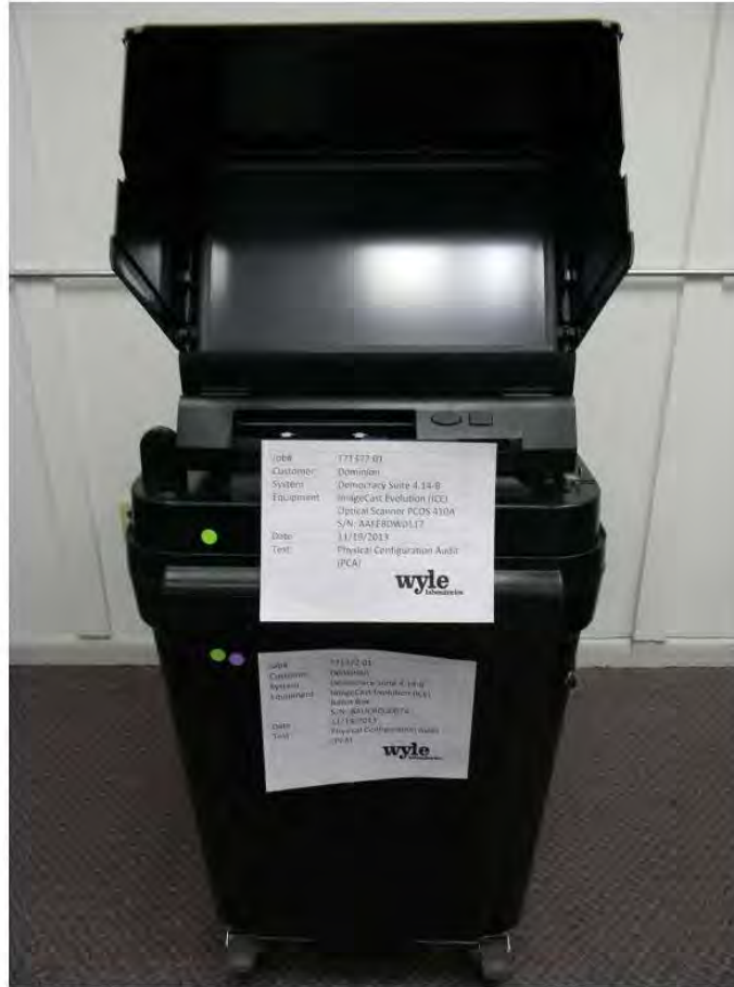
Photograph 1: ImageCast Evolution (ICE) on Plastic Ballot Box

(The remainder of this page intentionally left blank)